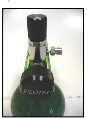
FloGripp<sup>™</sup> also eliminates the metallic securing pin used to hold the toggle in place That can cause cuts and abrasions during everyday use.

Black anodized non-glare finish Knurled finish for enhanced Gripp -ability Attachment via twin side set screws with supplied allen wrench All Metal Construction using 6061 Heat-Tempered Aluminum Alloy Same outer diameter as post valve body for ease of regulator attachment Portable oxygen cylinder use has never been easier or more convenient!